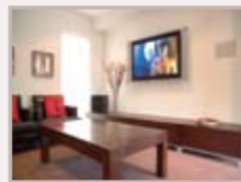
Hills Home Hub

The Hills Home Music system allows you to play music from 4 separate sources (eg stereo, radio, CD or DVD player) located at one central point in your home to Music Room Manager zones located inside or outside your home.