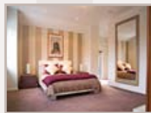
Distributed Audio System

The Hills Home Music system allows you to play music from 4 separate sources (eg stereo, radio, CD or DVD player) located at one central point in your home to Music Room Manager zones located inside or outside your home.